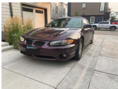
Sideways parking - no part of tire on curb or over