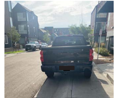
Sideways parking - tire overlaps into gutter