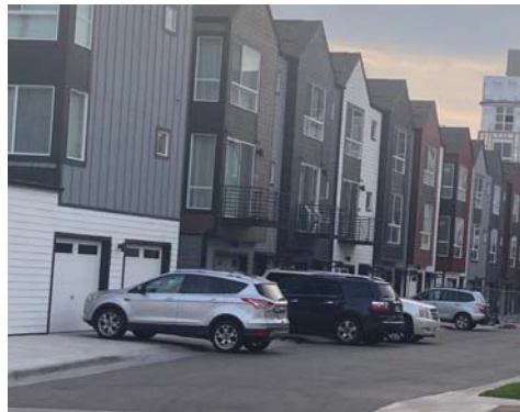
Driveway parking - overlapping into street